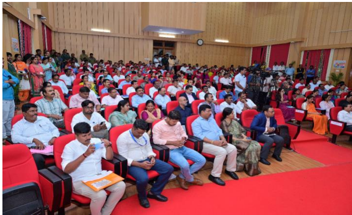
Above: KAS Officer participants and members of the audience